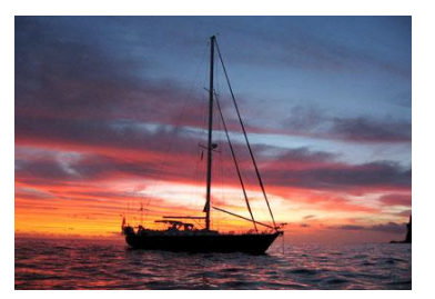
The difference between this Sunset Cocktail Cruise and the Sunset Dinner Cruise is that you'll enjoy canapes instead of the 19-course gourmet dinner.

Canapes are a combination of cream cheese on celery boats topped with cashew nuts, various cheeses, spicy chicken, tofu and cheese balls with spicy sauce, various pates and dips with vegetable sticks and crackers, aspic, olives and pickles, sushi rolls, mini rice cakes, Mexican favourites, tortilla chips with guacamole dip, special Crystal Yacht Holidays pastry strips and lots more.