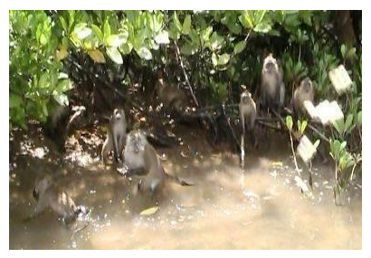
Coral Island Package (Snorkelling)

Adult: USD52/pax Child: USD40/pax (Durations: 4hrs; AM)